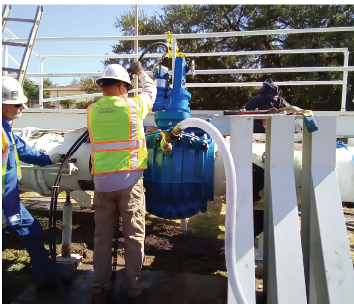
The blow off hose carried swarf created from the milling, away from the water inside the pipe.