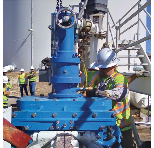
The EM machine was prepared for operation.