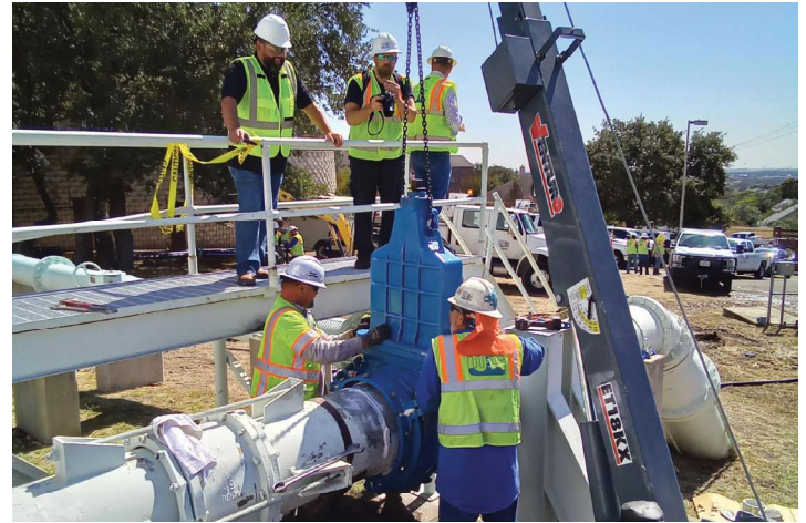
The bonnet was lifted into the valve body and secured in place.