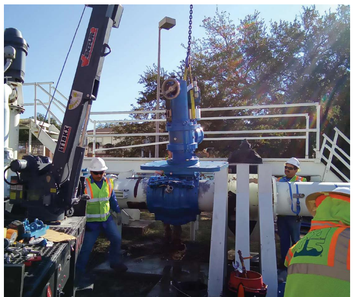
With the integral gate closed, the EM machine was removed.