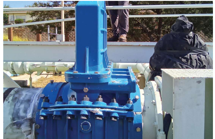
And the installation was complete.

Advanced Valve Technologies (AVT) is part of ClockSpring|NRI, the high-performance critical infrastructure solutions company. AVT's advanced solutions are based on simple designs that minimize risk to the environment and reduce costly downtime. Our primary focus is on disruptions in water service that cost providers money and leave end users without service.